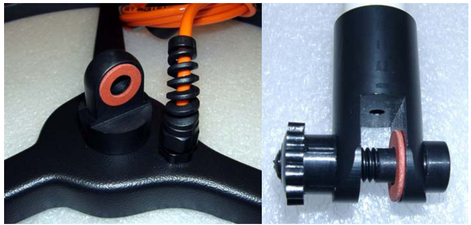
Washer in connector recess