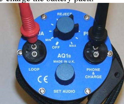
Battery Test Points (shown on the Standard AQ1B)