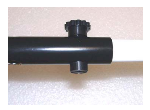
Note: There are three possible securing positions on the Arm Saver so that you can select the one which is more comfortable for you and most suitable for the job you are carrying out.

5. Now slide the opposite end of the Lower Shaft inside the Arm Saver as shown below and secure with the Nut and Bolt from the Arm Saver.