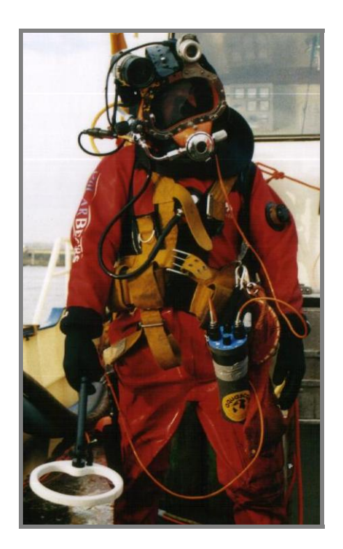
Diver prepared for EOD survey using AQ1B/20cm - Harness mounted

2. The Bonephone should be placed under the hood, if no hood is worn it can be placed under the strap of the facemask or under a suitable neoprene headband. Position the Bonephone so that it is on a bony part of the head close to the ear.