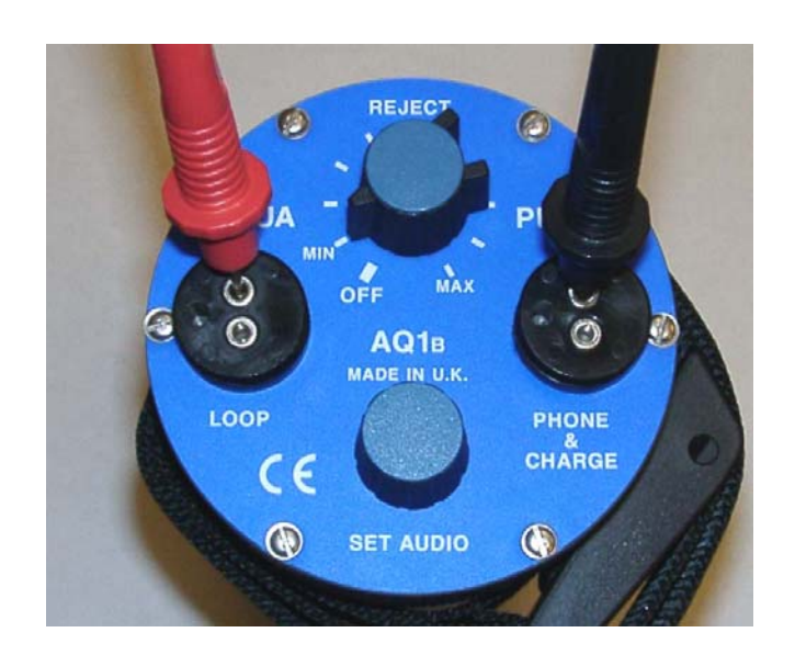
Battery Test Points

5. A fully charged new battery pack should read approximately 9.8 volts. This might decrease slightly as the pack gets older. As the detector is used, the voltage will drop gradually, but performance is not affected until the voltage drops below 8.4 volts. Once the voltage drops below 8.4 volts, it will drop at an accelerated rate. The detector will not function correctly if it gets down around 7 volts or lower. If you measure the voltage and it is near or below 8.4 volts, it's time to re-charge the battery pack.