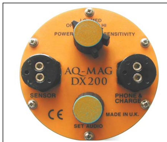
View of DX-200 module controls

Control Unit ..... 1.4Kg Probe & Cable ..... 0.7Kg Professional kit in transit case ..... 15 Kg